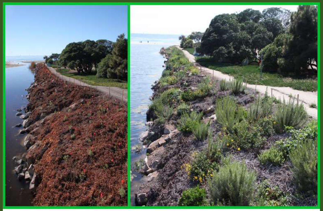
Project site (looking south) after removal of plastic sheeting and initial installation of native plants.