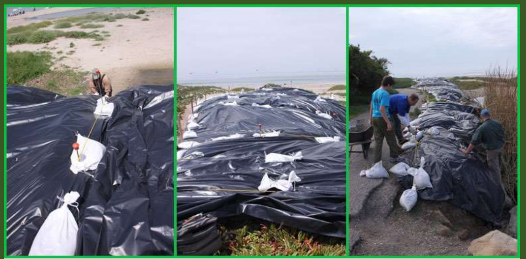
Left: staff suspends sandbags from stakes and lines to hold the plastic sheeting in place on a steep slope. Middle and right: finished sections.

Channel Islands Restoration Project (Carpinteria Creek Mouth Project)