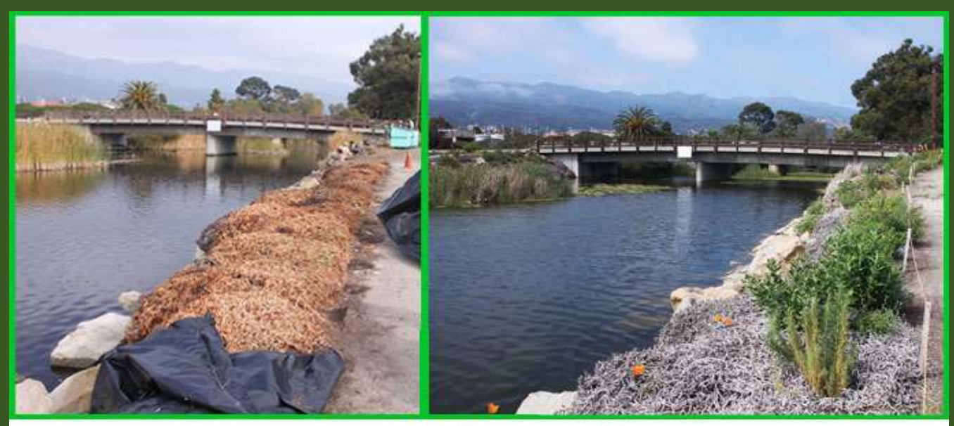
Project site (looking north) after removal of plastic sheeting and initial installation of native plants.