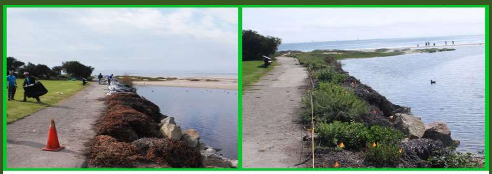
Project site (looking south) after removal of plastic sheeting and initial installation of native plants.