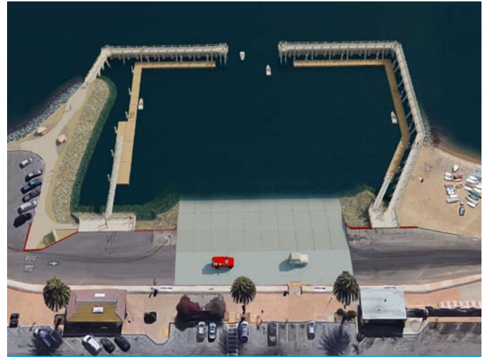
Artist rendering of improved launch facility.

The free public boat launch was originally constructed in the 1950s and underwent upgrades in 1976 and 2005. The Launch Facility Improvement Project was designed with extensive stakeholder input and is being made possible by $9.6 million in grant funding from California State Parks Division of Boating and Waterways and the California Wildlife Conservation Board.