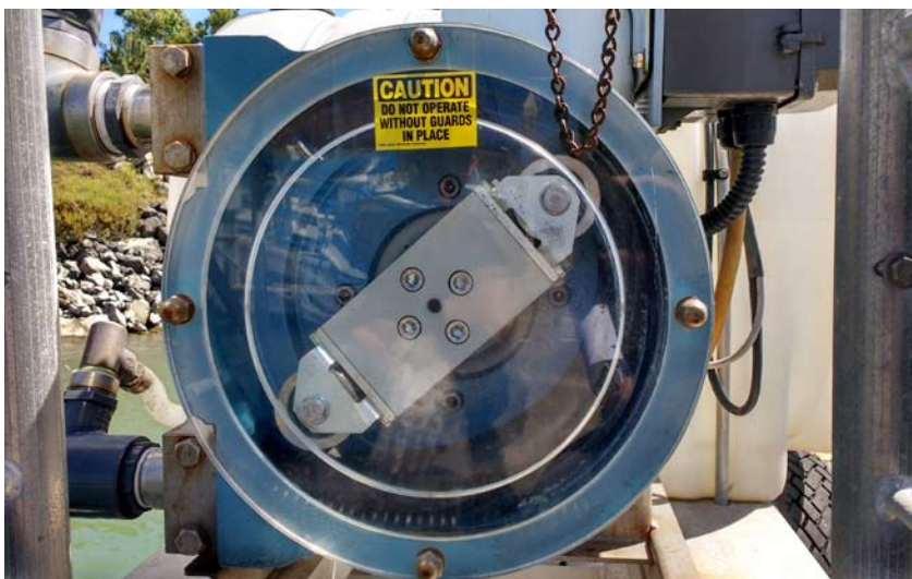
Check out the inside of a peristaltic pump.

The Pumpout Guide and Map for Boaters, the DBW Clean Boating Maps, or the Pumpout Nav App ( Android and iOS ) can help locate nearby pumpouts and include information about how to use them. Look for the national pumpout symbol to help guide the way. Once located, pumpouts should have a hose, a ball valve, a sight glass, a nozzle with a working back flap to prevent leakage, and clearly marked signage. Taking the hose off the rack and resting it flat on the dock helps the pump work more efficiently. Many marinas have staff to assist with older equipment, or to supply the nozzle tip. Don't be afraid to ask, marina staff are happy to show boaters how to use their equipment. Using pumpout equipment properly helps keep our waterways clean for all!