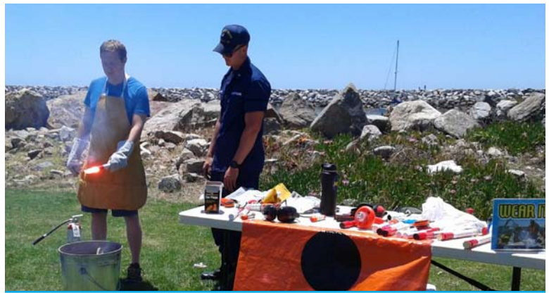
The Coast Guard taught boaters about different flare types, use, and safety.

As part of a trade-in program funded by California State Parks Division of Boating and Waterways, attendees also turned in worn life jackets and exchanged them for new, properly-fitted U.S. Coast Guard approved life jackets.