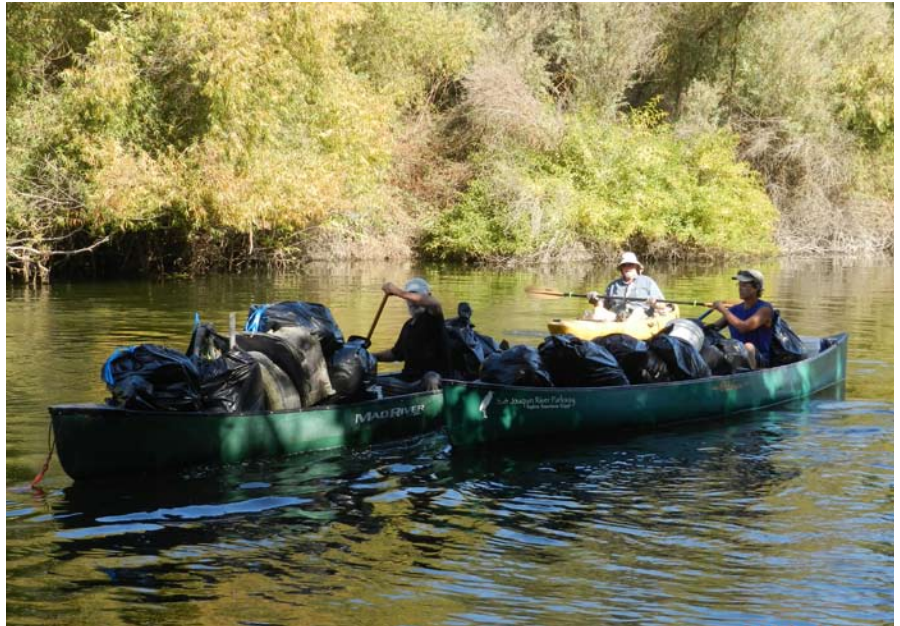
Participants enjoyed the Great Sierra River cleanup in 2016.

In 2016, 34 boating facilities and more than 864 volunteers collected 17,249 pounds of trash and recyclables on land and from the water using 64 vessels (kayaks, canoes, and dinghies). Statewide more than 59,000 volunteers participated and removed over 1 million pounds of trash and recyclables from our waterways and beaches.