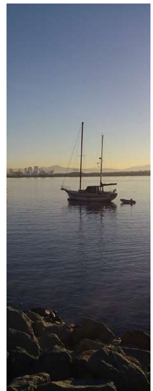
Morning view from Shelter Island.

For more information on the Shelter Island Boat Launch Facility Improvement Project, please visit portofsandiego.org/sibl .