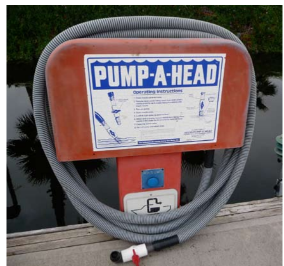
This is one example of a diaphragm pump.