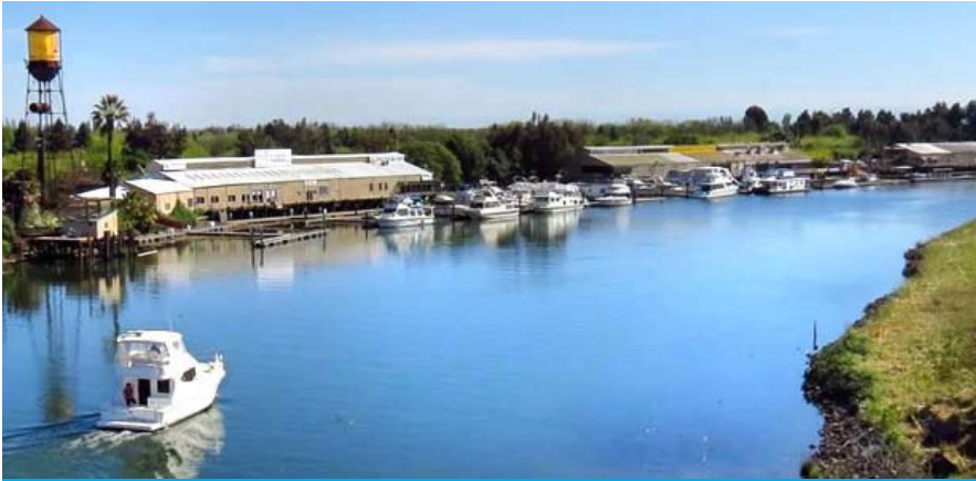
Tower Park Marina on Little Potato Slough

Tower Park Resort and Marina has been a destination for almost fifty years and continues to be a great jumping off point to explore the beautiful and historic California Delta.