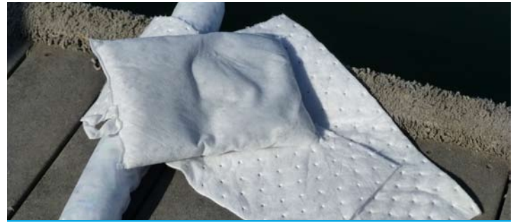
Different types of oil absorbents.

Oil and fuel contain harmful components which can affect human health and severely damage our aquatic environment (even very small quantities). In addition, any spill that creates a sheen on the water can result in hefty fines to boaters, and marina or yacht club operators. It is important to follow some clean boating practices that will help to prevent oil spills in the water.