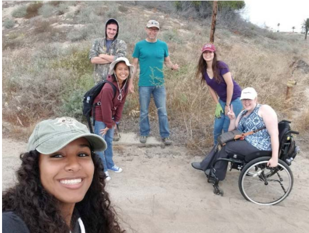
LMU interns at LAX Dunes

Water and Energy Conservation – This project worked with middle schools to conduct outreach and education on water, energy, and natural gas conservation. The project was completed in 2017 and included the development of many educational tools such as infographics and story-maps and concluded with the development of a Final Report in July. Completed.