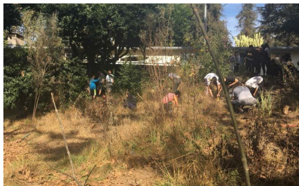
Stone Canyon Creek volunteers 2017

Evaluating Regional Wetland Monitoring Programs – This program is working towards increasing our regional understanding of the condition of our coastal wetland systems, and applying that knowledge towards standardizing wetland monitoring across the state of California. In 2017, this program continued work on a site-intensive data translator and held workshops for vegetation, invertebrate, and water quality monitoring. Ongoing.