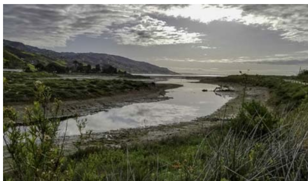
Malibu Lagoon, April 2017

Malibu Lagoon Post-Restoration Monitoring – This long-term comprehensive monitoring program evaluates the condition of the post-restoration Lagoon through biological, physical, and chemical surveys. In 2017, a four-year comprehensive monitoring report was completed and released in August, and surveys continued into the fifth year of monitoring. The Lagoon continues to have improved circulation, water quality, and overall condition. Public restoration events are held monthly to remove non-native, invasive vegetation. Ongoing.