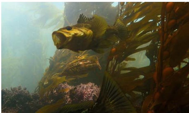
A kelp bass (Paralabrax clathratus) gaping its mouth in the surge off the Palos Verdes Peninsula.

Kelp Forest Restoration – This project aims to restore up to 150 acres of giant kelp forests. Commercial fishermen and TBF scientists monitor and restore these reefs as they are transformed from urchin barrens to kelp forests. 4.67 acres of kelp have been restored in 2017 contributing to a total of 43.27 acres since the project began in 2013. Results from 2017 describe increases in the abundance, biomass and diversity of macroalgae, invertebrates and fishes in the restored sites. In one site, kelp canopy increased by 250%. Ongoing.