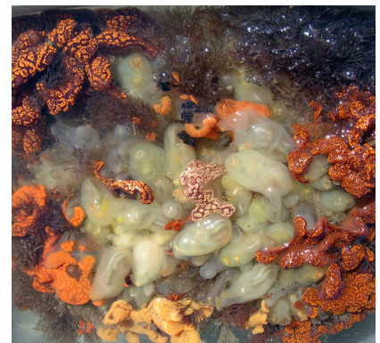
Moderate Years: Mixed Organisms