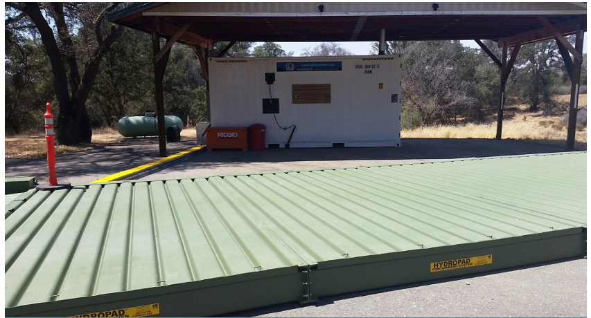
Camanche Reservoir's Northshore decontamination station.

Quagga mussels were first detected in California in 2007 in San Bernardino County and have since spread to waterways in surrounding counties including Riverside, Imperial, San Diego, Orange, Los Angeles, and Ventura Counties. Zebra mussels were first detected in San Benito County in 2008. Recreational activities, including boating and fishing, can spread these invasive species from infested waters to not infested waters.