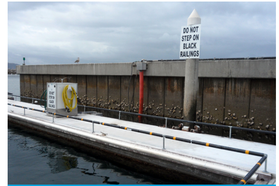
Rolling rails help keep docks clear for boaters.

Boaters can find and learn how to use functioning pumpouts through the free Pumpout Nav App, or check out DBW's clean boating maps, stocked at many marinas. For more sewage pumpout resources check our website . Pumpout locations are also listed online at www.dbw.ca.gov/Pumpouts .