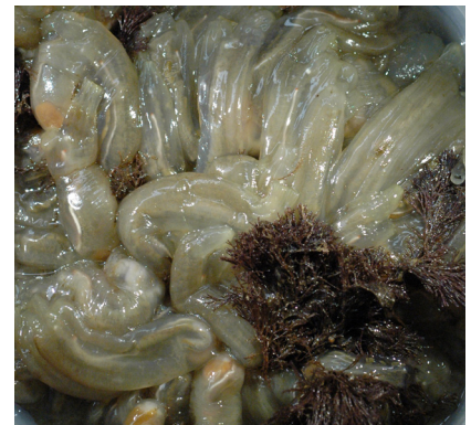
Dry Years: Solitary Tunicates

Boaters and facilities operators can help by carrying out regular maintenance and keeping hulls clean to reduce the risk of transporting invaders to new places. Such maintenance is particularly important before transiting between bays, or between water bodies. In addition, coordinated efforts by agencies and other groups to remove invaders and improve native habitats may benefit from being timed to take advantage of wet winters. For more information visit: https://serc.si.edu/tiburon-research-branch .