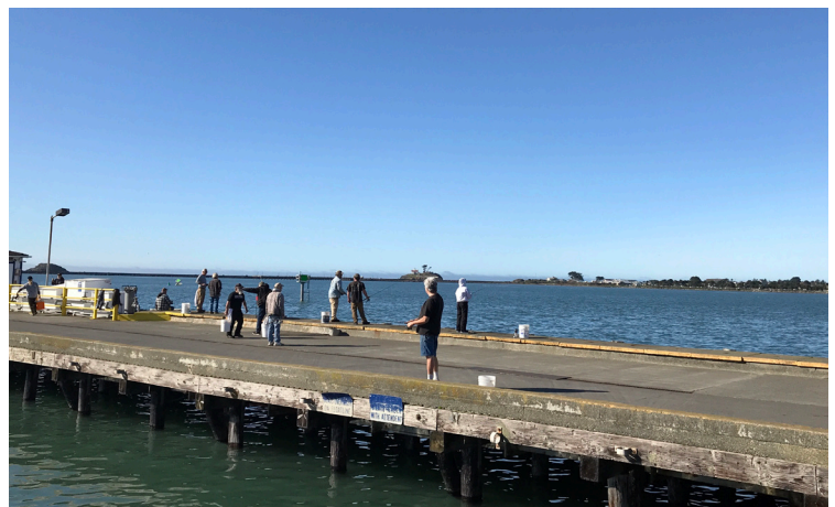
People fishing for herring from Citizens Dock.

For more information on Crescent City Harbor visit: www.ccharbor.com .