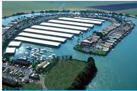
Oxbow Marina in the Sacramento-San Joaquin Delta.

Oxbow Marina is a fifth-generation, family-owned marina located on the Georgiana Slough in the middle of the Sacramento-San Joaquin River Delta. The Korth family started the marina in 1979 after establishing themselves in the region building boats in the early 1930s. The property sits on a bend between the Sacramento and Mokelumne rivers, just a short drive from the historic town of Isleton in Sacramento County. Residents and guest boaters can enjoy the slower currents and winds, and take advantage of the great boating, fishing, and water sports, or just do some old-fashioned relaxing.