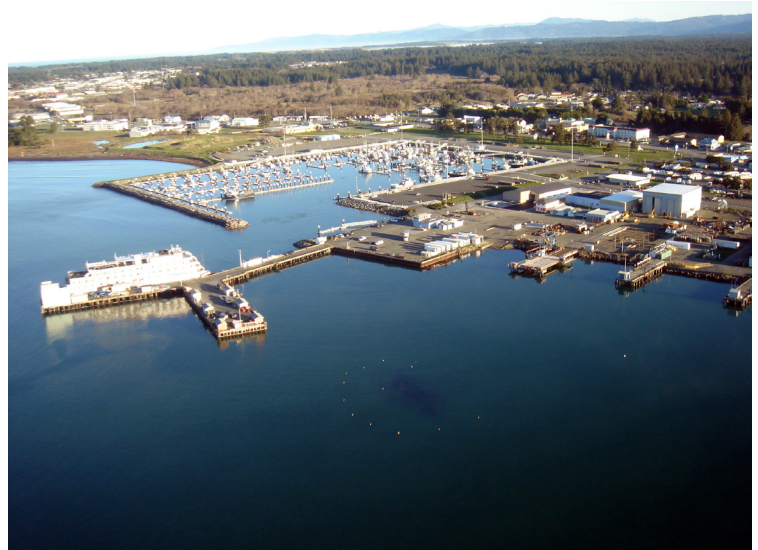
Crescent City Harbor

Following the 8.3 magnitude earthquake off Chile in 2015, the small tsunami that hit the harbor showed the new design was a success. The flow entered the harbor and crashed into H Dock. The dock broke up the tidal flow and did not allow the damaging clockwise pattern to form.