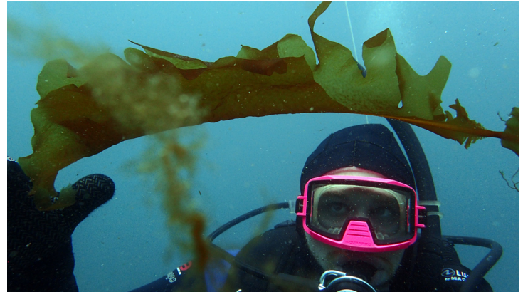
CINMS Diver Ryan Freedman holds up an invasive Undaria pinnatifida during an algae survey dive.

For these reasons, the sanctuary and partners are working on an invasive species management plan to control the spread and prevent further introductions. Learning from the management approach to address quagga and zebra mussel invasions in fresh-water bodies, we recognize a broad geographic approach across local, state, and national jurisdictions and agencies is required. One of the major goals of the plan is to create a network of coastal partners to increase the capacity to control invasive species along our coast.