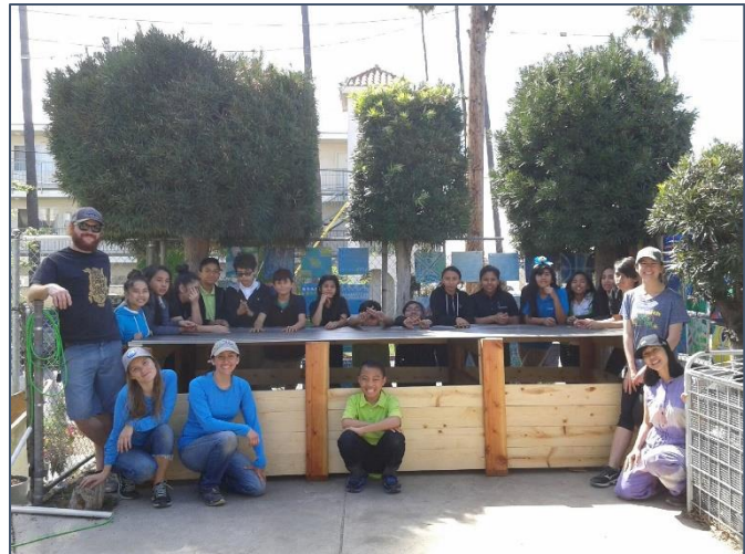
Table-to-Farm Composting – To better address food waste and greenhouse gas emissions from landfills and transportation due to hauling waste, TBF is working with restaurants in Inglewood and Gardena and Environmental Charter Middle Schools (ECMS) to close the food loop. In 2018, the program built a second compost bin at ECMS Gardena. Since September 2017, 5,276 lbs of food waste has been diverted from landfills and composted, in a four-bin system. 720 students have been engaged in the program and have learned about food waste, compost, and climate issues.

Water Quality Monitoring – This project is conducted in partnership with CRI to fill important water quality data gaps for our region while contributing data in support of the Comprehensive Monitoring Program. In 2018, three master's theses were completed analyzing the effectiveness of LID implementation. The first two projects found that the garden retained between 73-100% of all stormwater, with 80-90% reduction in pollutants. Most of the pollutants were retained in the top layers of soil, but below regulatory trigger thresholds. The third project assembled 30 years of fecal indicator bacteria along Bay beaches and found decreasing trends over time for most sites.