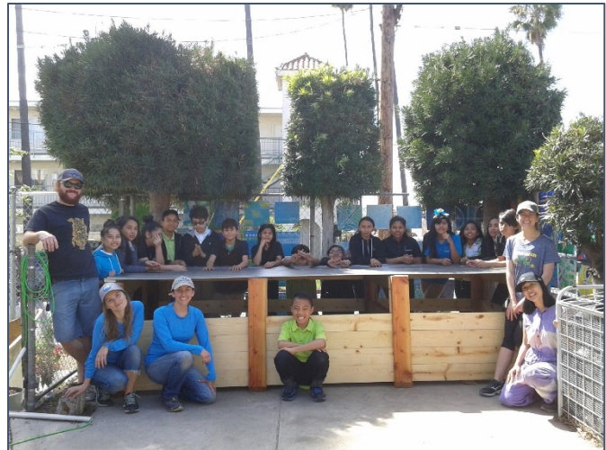
Table-to-Farm Composting – To better address food waste and greenhouse gas emissions from landfills and transportation due to hauling waste, TBF is working with restaurants in Inglewood and Gardena and Environmental Charter Middle Schools (ECMS) to close the food loop. In 2018, the program built a second compost bin at ECMS Gardena. Since September 2017, 5,276 lbs of food waste has been diverted from landfills and composted, in a four-bin system. 720 students have been engaged in the program and have learned about food waste, compost, and climate issues.

Water Quality Monitoring – This project is conducted in partnership with CRI to fill important water quality data gaps for our region while contributing data in support of the Comprehensive Monitoring Program. In 2018, three master's theses were completed analyzing the effectiveness of LID implementation. The first two projects found that the garden retained between 73-100% of all stormwater, with 80-90% reduction in pollutants. Most of the pollutants were retained in the top layers of soil, but below regulatory trigger thresholds. The third project assembled 30 years of fecal indicator bacteria along Bay beaches and found decreasing trends over time for most sites.