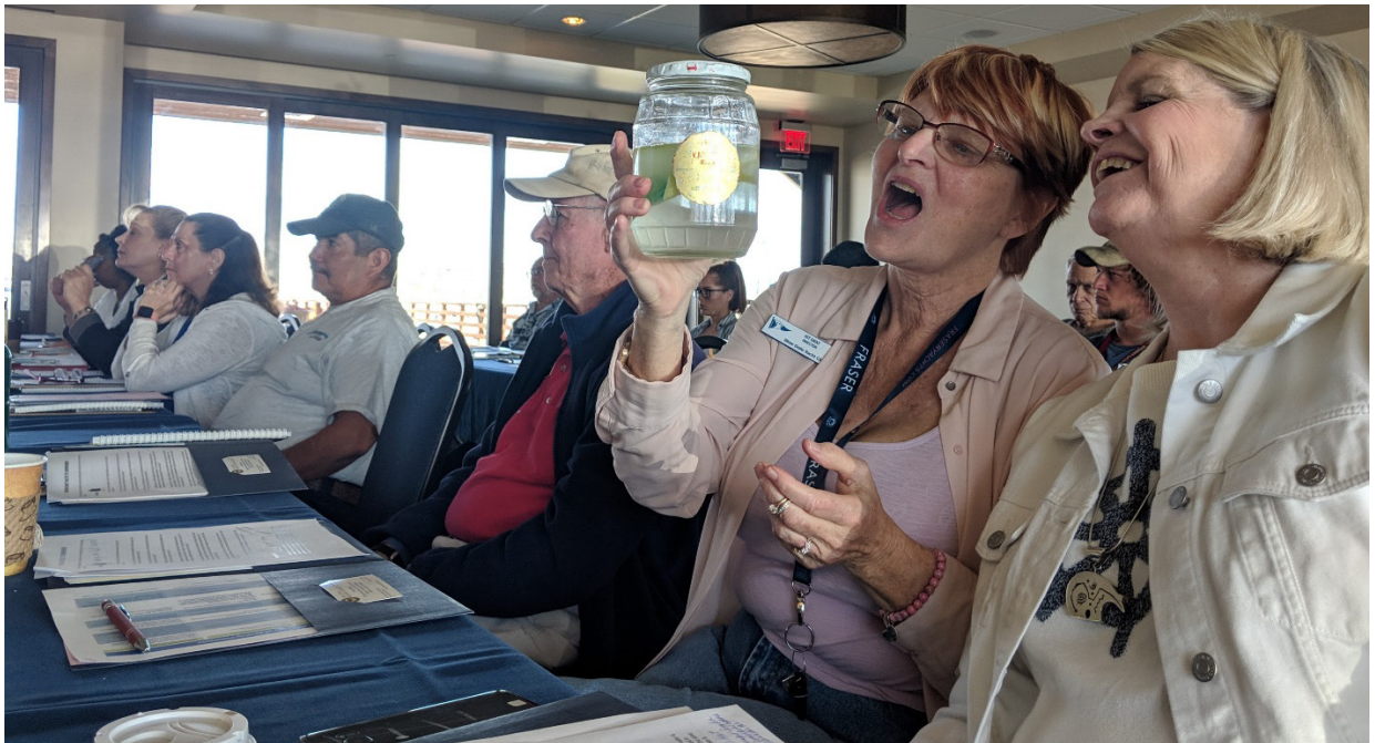
During a Dockwalker training volunteers are enthusiastic to learn how oil absorbents.

This is a multi-faceted program designed to engage the Southern California boating community to reduce and eliminate boating-related ocean pollution. In 2019, the program continued to publish “ The Changing Tide ” statewide newsletters, annual tide books, and published the 5 th edition of the popular Southern California Boater’s Guide . Through the Honey Pot Day program, mobile sewage pumpouts are offered; in 2019, 110 boaters participated, and 2,160 gallons of sewage were properly disposed. The program also produced and distributed 3,150 Boater Kits and trained 89 Dockwalker volunteers. The Pumpout Nav app has been updated to include sewage dump stations and floating restrooms in addition to sewage pumpout stations. TBF and San Francisco Estuary Partnership, in partnership with California State Parks Division of Boating and Waterways, was awarded the ‘Outstanding Service Award’ for the Pumpout Nav app at the States Organization for Boating Access.