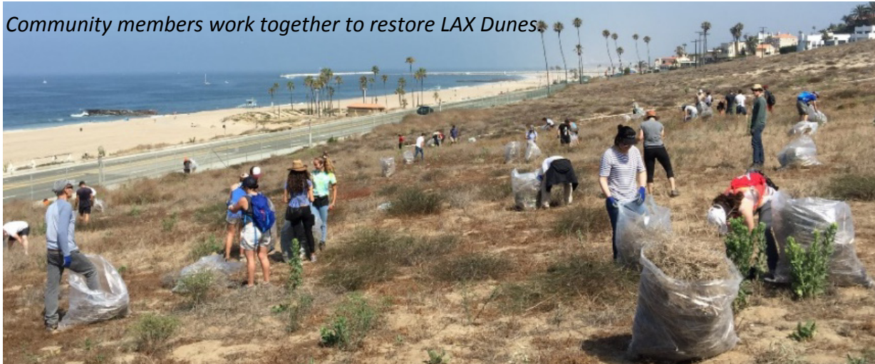
Community members work together to restore LAX Dunes.