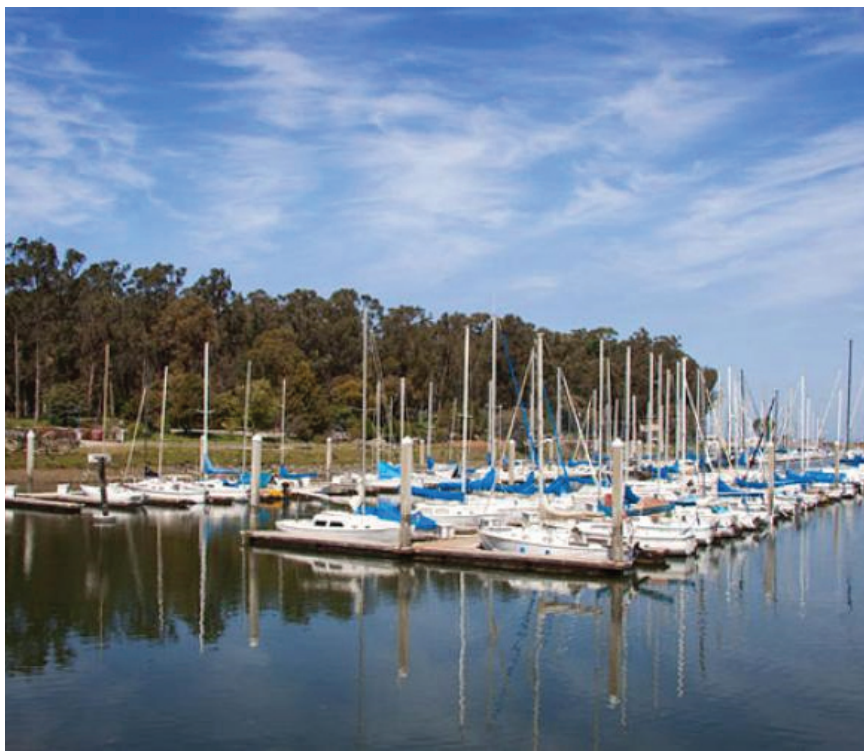
Coyote Point Marina, North Dock View