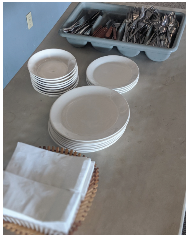
Before (top) and after (bottom) use of foodware at Berkeley Yacht Club