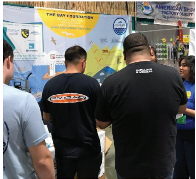
Spectacular Dockwalking by the Conservation Corps of Long Beach

Don't miss meeting with Dockwalkers at Marina del Rey's Marina Fest , held June 20-21, to learn how to make a positive impact while on the water.