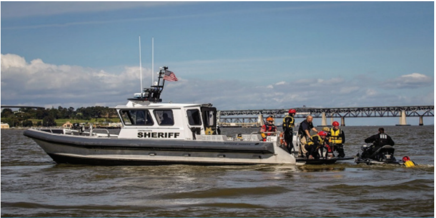
Contra Costa Marine Patrol Unit in action