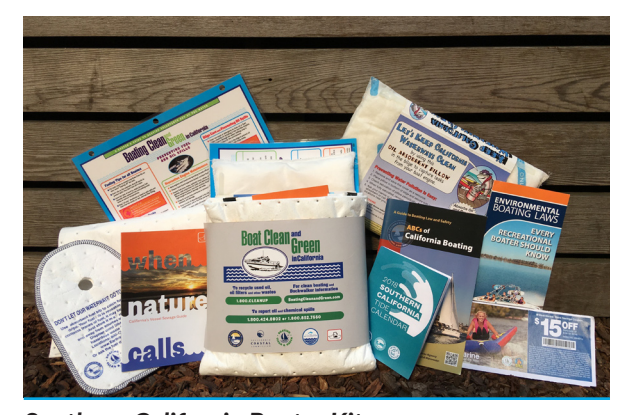
Southern California Boater Kit

Get your Free California Boater Kit. Key items of this comprehensive clean boating kit include oil absorbents, a fuel bib, the "ABCs of Boating Laws," Tidebooks, and more. Take this quick online questionnaire and receive one.