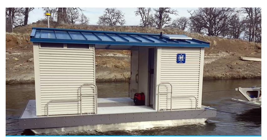
Floating Restrooms in Lake Berryessa