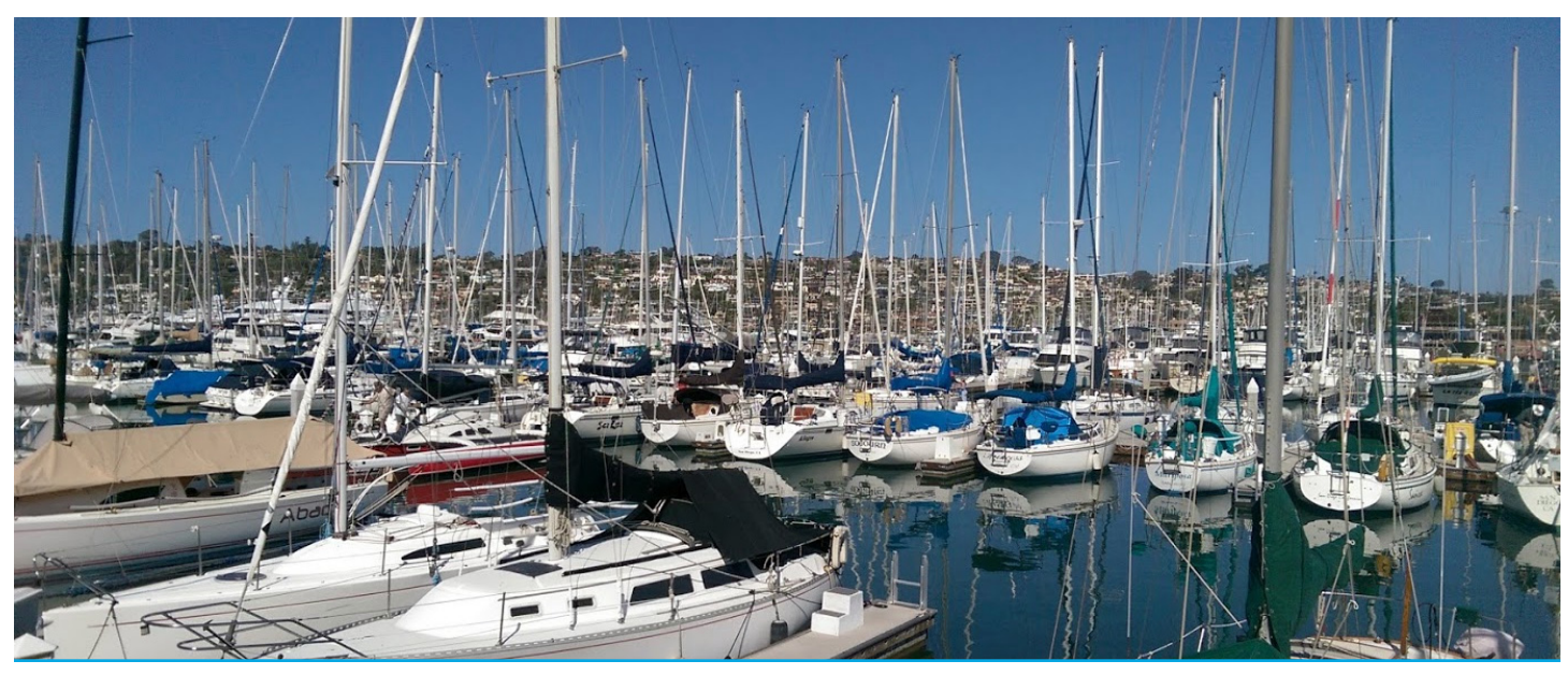
Shelter Island, San Diego