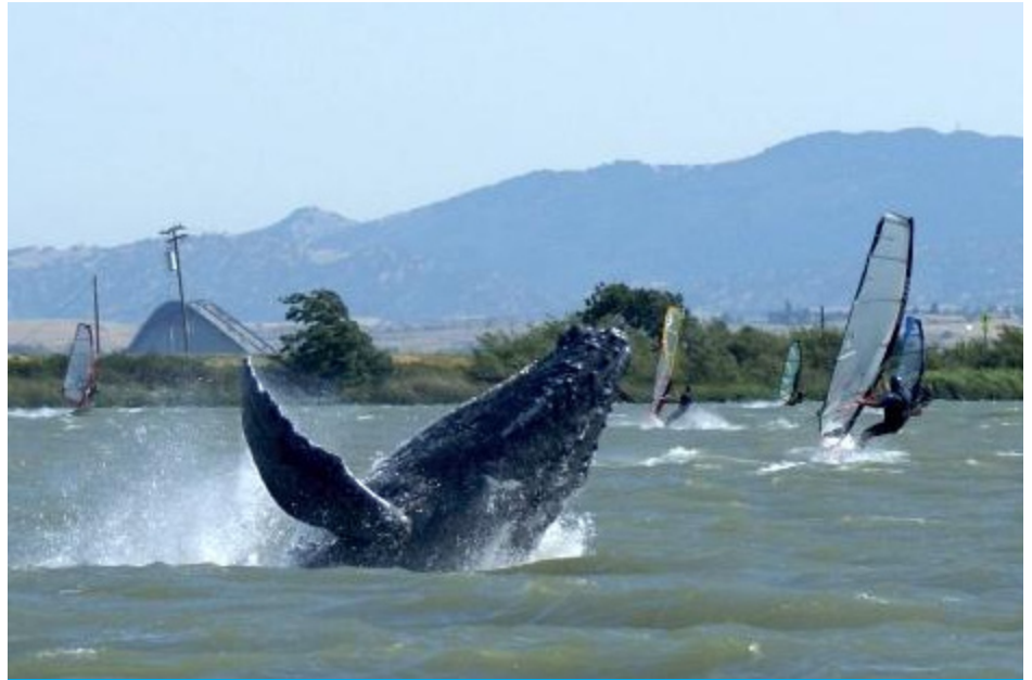
Humpback Whale Delta/Dawn (breaching in Sacramento River)