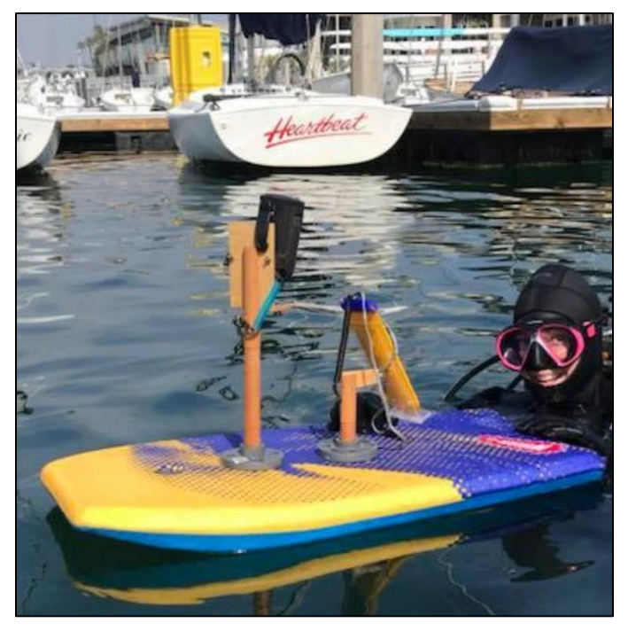
Figure 6. Biologist with Paua Marine Research Group outfitted with Trimble R1 GNSS Receiver used to map an eelgrass bed.

Surveys should be conducted twice yearly in June, September, (end of growing season) in line with regional monitoring efforts and NOAA California Eelgrass Mitigation Policy (CEMP) protocol. Aerial cover should be measured and mapped by divers on SCUBA using a Trimble R1 Global Navigation Satellite System receiver linked with a smartphone (or similar setup) (Figure 6). This mapping is done by having a single diver swim the outline of the eelgrass bed perimeter towing a Pelican float, while a second diver follows this path with the Trimble R1. This receiver, enabled with real-time Satellite-based Augmentation System correction, provides sub-meter accuracy during mapping. Data are then exported to the Trimble Terraflex cloud system for review and are available as shapefiles.