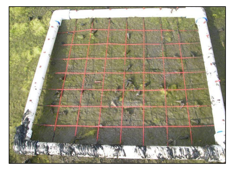
Figure 2. Quadrat placement in a wetland tidal channel.