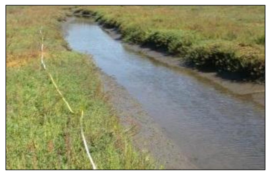
Figure 4. Transect deployment adjacent to a tide channel.