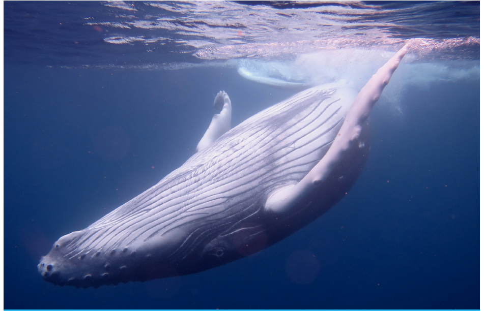
Humpback whales are the type of whale most commonly found entangled off our coast

Home to many of the world's magnificent marine animals, California has a rich array of whales, dolphins, and turtles living right here in our waters. This past month, Dana Point in Southern California was even recognized as the first Whale Heritage Site to be designated in the U.S. Unfortunately, however, many of these species are endangered and all face threats, such as entanglement, being hit by ships, or killed from ingesting plastic trash, which they often confuse for food. In an effort to help save these amazing animals, statewide organization Saving Ocean Wildlife (SOW) helps bridge the gap between the agencies studying and managing these animals and the community who cares about them.