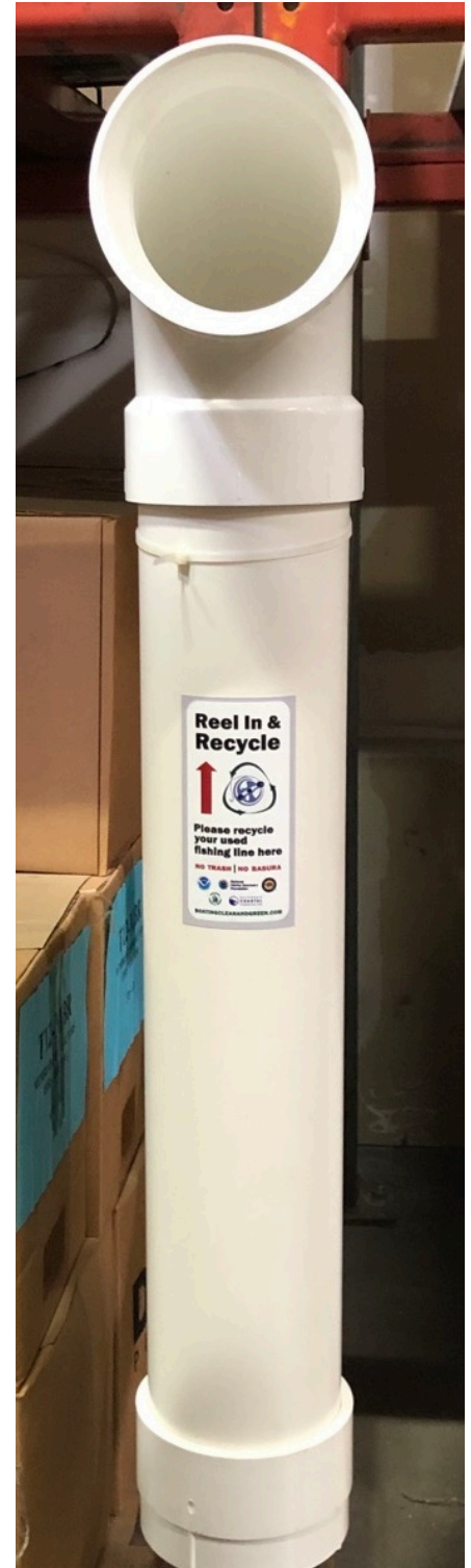
New Fishing Line Recycling Station

Once the portable container is full, bring the collected line to a fishing line recycling station near you . Alternatively, you can mail the line directly to: Berkley Recycling Collection Center (address above)