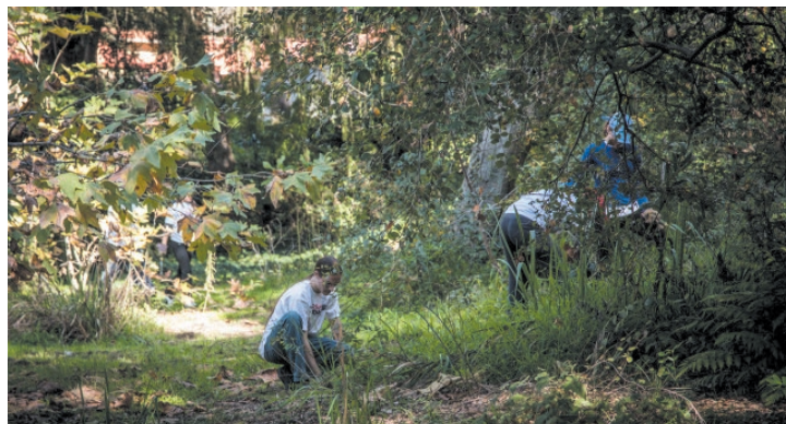
Stone Canyon Creek restoration, in partnership with UCLA Lab School, attracts monthly volunteers.

Rindge Dam Removal Study – An assessment to inform the feasibility of restoring and enhancing the Malibu Creek ecosystem through the removal of Rindge Dam in partnership with California Dept. of Parks and Recreation, US Army Corps of Engineers, and other agencies. Ongoing. (SMBRC, TBF)