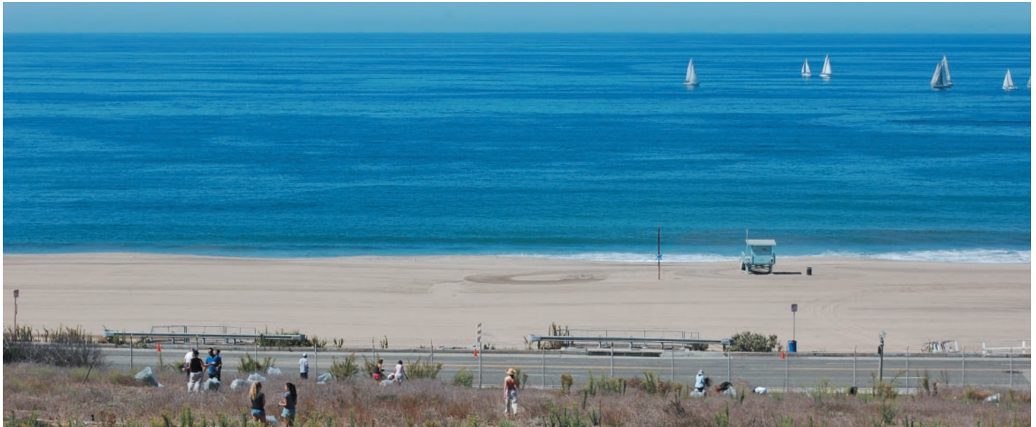
Volunteers remove invasive vegetation monthly at the LAX Dunes ongoing restoration overlooking Santa Monica Bay in El Segundo.

Welcome! Thank you for your interest in the ongoing work of the Santa Monica Bay National Estuary Program (SMBNEP). In our 2015 Annual Report you'll find: a summary of our accomplishments, highlights from specific programs or projects, and a breakdown of our funding. These results wouldn't be possible without the contributions of persons and organizations dedicated to our mission, to restore and enhance Santa Monica Bay through actions and partnerships that improve water quality, conserve and rehabilitate natural resources, and protect the Bay's benefits and values.