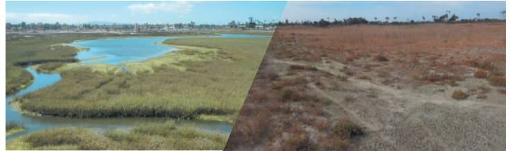
The difference between a relatively healthy wetland, Steamshovel Marsh (left), and a highly degraded wetland (Ballona Reserve, right). For details and data results on both wetland systems and more throughout southern California, review the Regional Monitoring Report .

The project compiled and analyzed existing assessment procedures, developed proposed standardized approaches in coordination with technical advisors throughout California, explored the covariance between new site-intensive protocols and existing assessment tools (i.e. California Rapid Assessment Method, or CRAM), and developed standardized protocol documents and training materials to facilitate information transfer to other projects. The effort has been an impressive example of a statewide