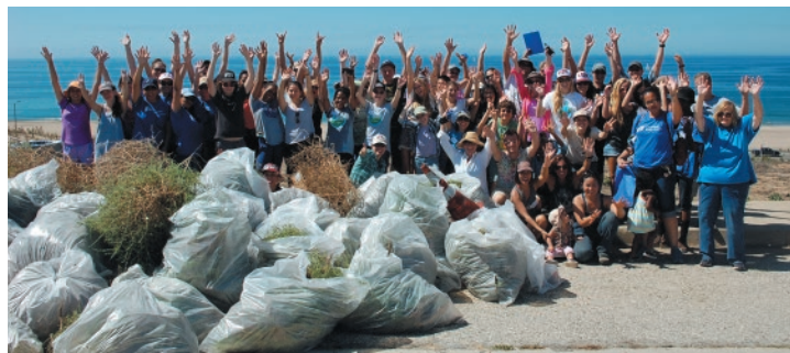
This year, The Bay Foundation moved its Coastal Cleanup Day from Marina del Rey to the LAX Dunes, where over 70 volunteers pulled over a ton of invasive weeds.

State of the Bay Conference – A conference featuring presentations and panels addressing a wide range of topics informative and critical to the future health of our coastal environment. The event was held at Loyola Marymount University on Sept. 9, 2015 and attended by over 200 people. Completed. (See p. 5 of the report for expanded information.) (SMBRC, TBF)