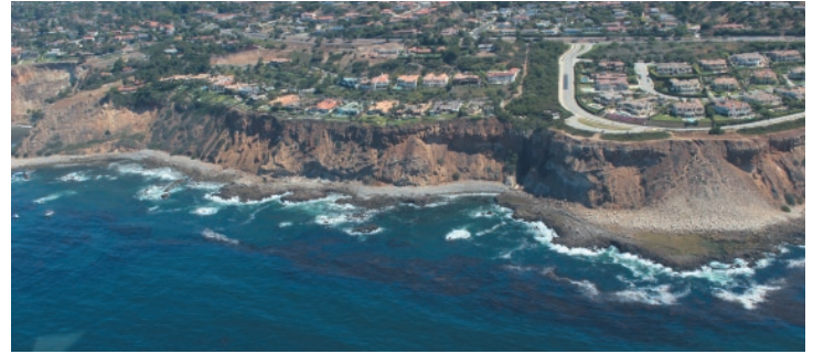
Aerial photo of a section of Palos Verdes. Areas like this are being studied to determine how waves and currents can be affected by the presence of kelp forests.

Project partners: Los Angeles County Sanitation District, City of Los Angeles Environmental Monitoring Division, Southern California Coastal Water Research Project, Scripps Institute of Oceanography