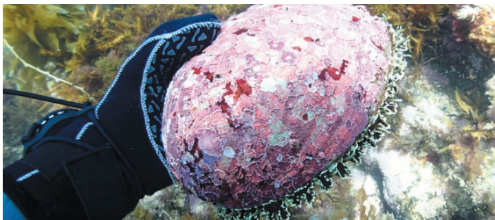
TBF diver collects a green abalone ( Haliotis fulgens ) off Catalina Island to conduct research on wild abalone spawning patterns.

boat based pollution included a Motorized Boater Survey; expansion of Honey Pot program, including implementation of the Honey Pot Day mobile pumpout program; installation of four Oil Absorbent Exchanges; and coordination of multiple outreach and education events throughout Southern California. Ongoing. (SMBRA, TBF)