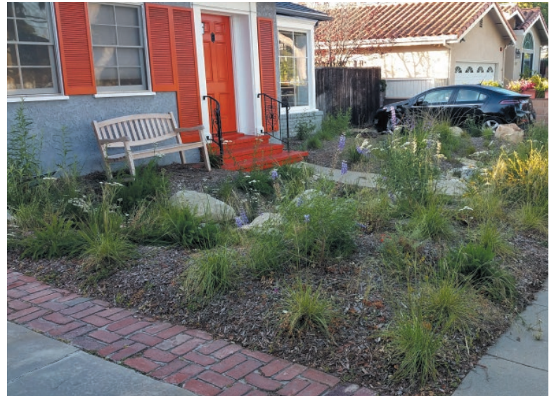
Front yard of a Culver City home before and after grass removal and installation of a rain garden funded by a grant from the Metropolitan Water District.

Rainwater Harvesting – A project that installed four residential rain gardens in 2015, funded by a grant from the Metropolitan Water District. Monitoring of the four systems' post-installation performance continues through storm water sampling and collecting water conservation data. Ongoing. (TBF)