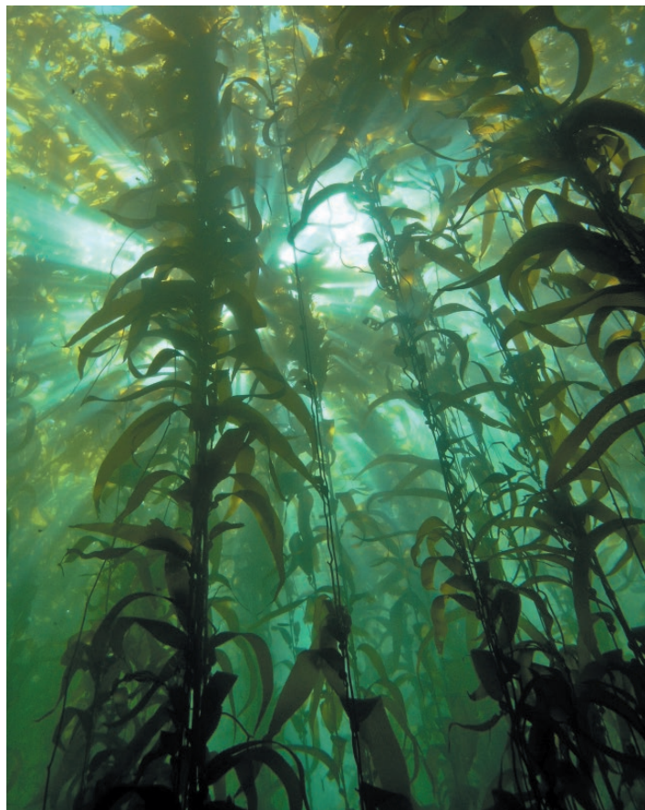
Kelp forest canopy in Point Vicente Cove, Palos Verdes, CA, from approximately 20 feet deep.

The Bay Foundation (TBF)—also known as the Santa Monica Bay Restoration Foundation (SMBRF)—is an independent, non-profit 501(c)(3) organization founded in 1990 and serves as the fiscal partner for the SMBNEP, annually receiving important grants and donations. TBF provides administrative, management and program services to the NEP. The purpose of the Foundation is to contribute to the restoration and enhancement of Santa Monica Bay and other coastal waters and to complement the work of the SMBRC through the BRP, with a focus on obtaining and expending funds not otherwise available to the SMBRC. ( www.santamonicabay.org )