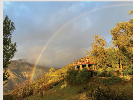
Xanabu, Malibu | Magical Weekend