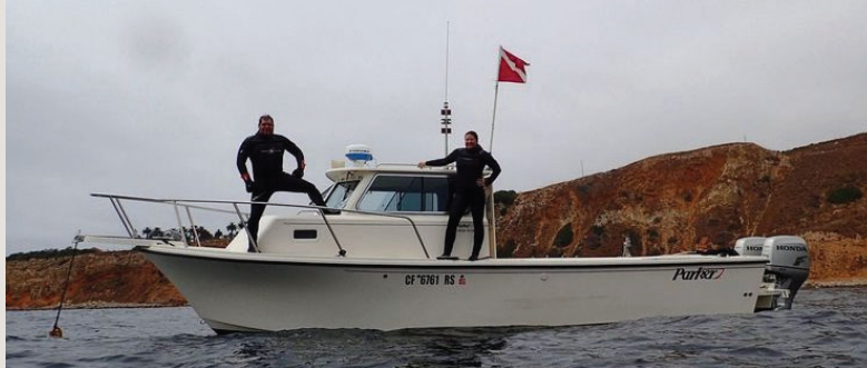
Coastal Excursion with The Bay Foundation