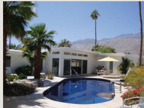
Palm Springs | Desert Oasis