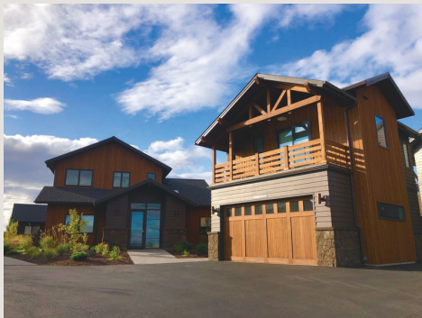
Bend, Oregon | Ski Chalet