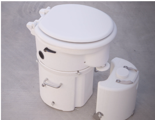
Marine Composting Toilet.

For a comprehensive understanding of how marine composting toilets operate, delve into the informational guide provided by The Bay Foundation. Elevate your knowledge further by watching our informative video , showcasing the myriad benefits of marine composting toilets. The video is also available with Spanish captions. Embrace the transformative advantages of marine composting toilets this season and revolutionize your boating experience.