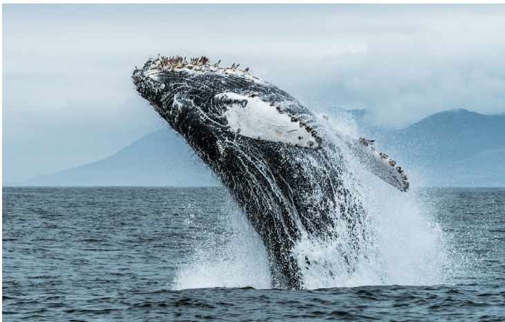
Breaching Humpback Whale, Avila Bay, San Luis Obispo County.

To prevent disturbance, the National Oceanic and Atmospheric Administration's (NOAA) National Marine Sanctuaries advises watching for a whale's