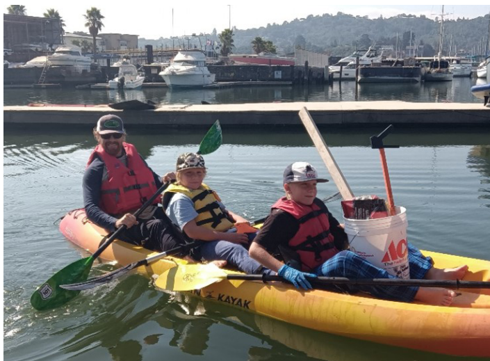
Volunteers from Surf Sports in Marin County.