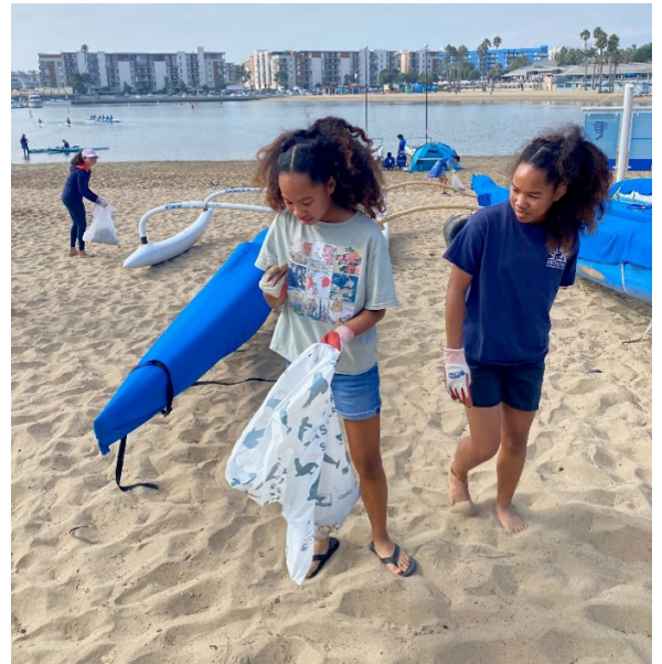
Volunteers from Marina Del Rey Outrigger Canoe Club.

The event enjoyed a strong volunteer turnout in both coastal counties and inland areas. On-the-water participation continues to grow among boating facilities and boating groups as well.